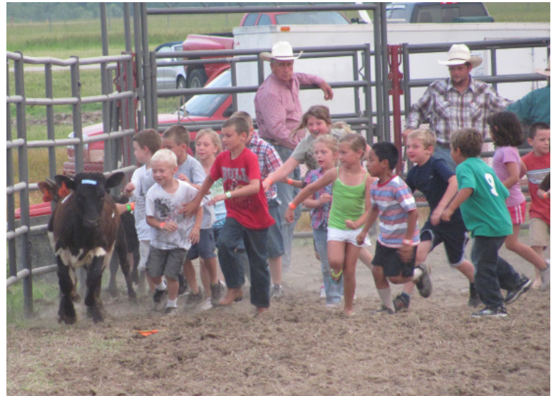
Kids chase a calf at the Belleville Club rodeo.